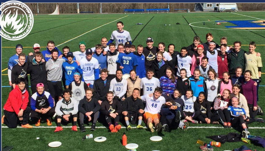
Current players and alumni at alumni weekend this spring