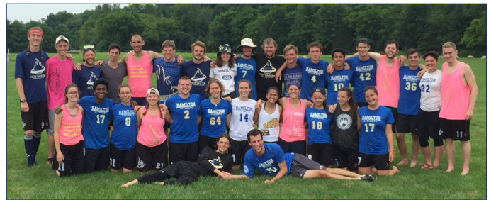
Current players and alumni (mostly in pink) at OMK

sity club teams. In Sunday's first game, the Hot Saucers ultimately lost to PandaTime on the universe point (11-12), but not after being down 7-3, clinching break after break and scoring eight points in the second half due to high spirit and cool heads. The tournament ended on the Sunday with the Hot Saucers and Hamilton 2 Benjamins scrimmaging each other and then mixing up the teams even further so old friends could play together once again.